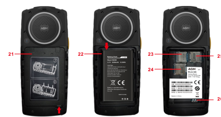
*Device photos may differ in colors or models on M6/M6 SE/M6 PRO