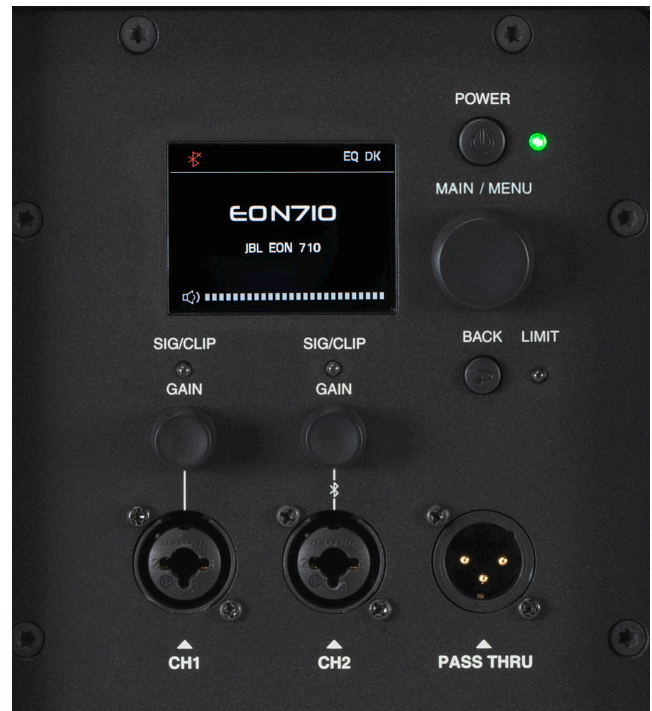
REAR PANEL CONNECTIONS

The JBL EON710 10-inch loudspeaker, part of JBL's new EON700 Series of powered PAs, brings advanced DSP and control to portable systems for live sound and installed applications, with class-leading volume and clarity and comprehensive features that make setup and operation a breeze.