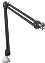
Studio arm (PSA1 - optional)