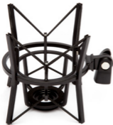
Shock mount (PSM1 - optional)