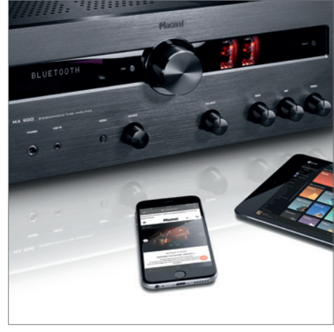
Tablet, smartphone and computer can be used via Bluetooth®.