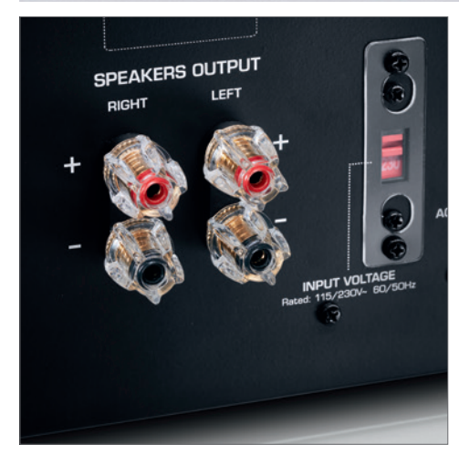
High-quality inputs/outputs for various purpose.