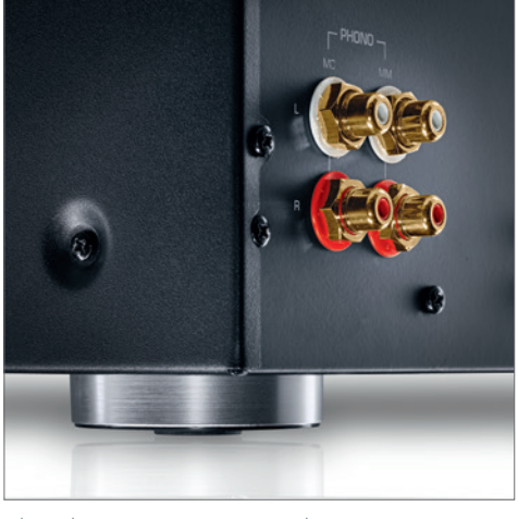
The phono preamp provides separate inputs for MM and MC systems.