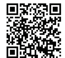
MSI Current Promotions