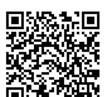
Installation Guide (NVIDIA)