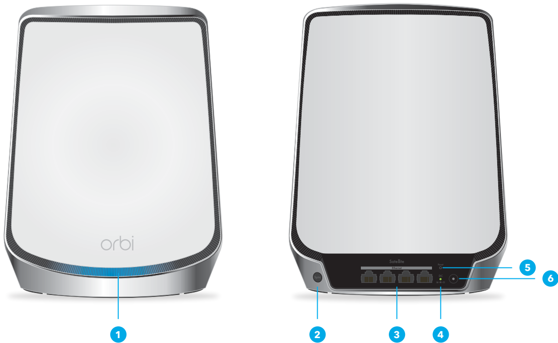
Figure 2. Orbi satellite front and back views

The following figures shows the Orbi satellite hardware features.