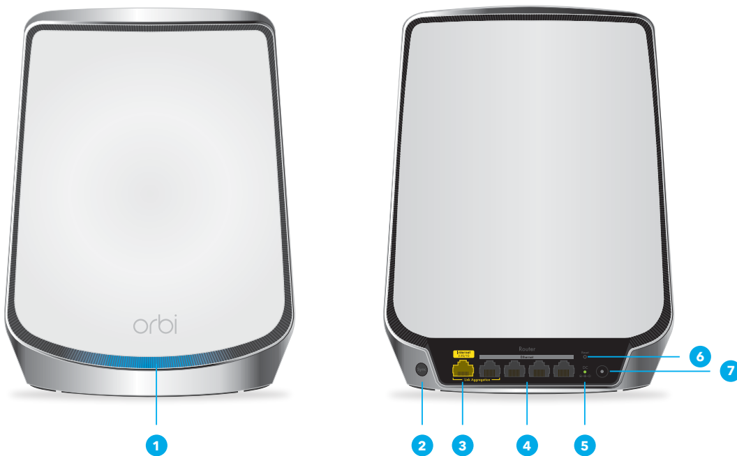
Figure 1. Orbi router front and back views

The following figures shows the Orbi router hardware features.