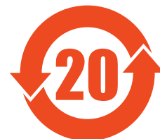
Table 5 Hazardous Substances

(Name and Content of the Hazardous Substances in Product)