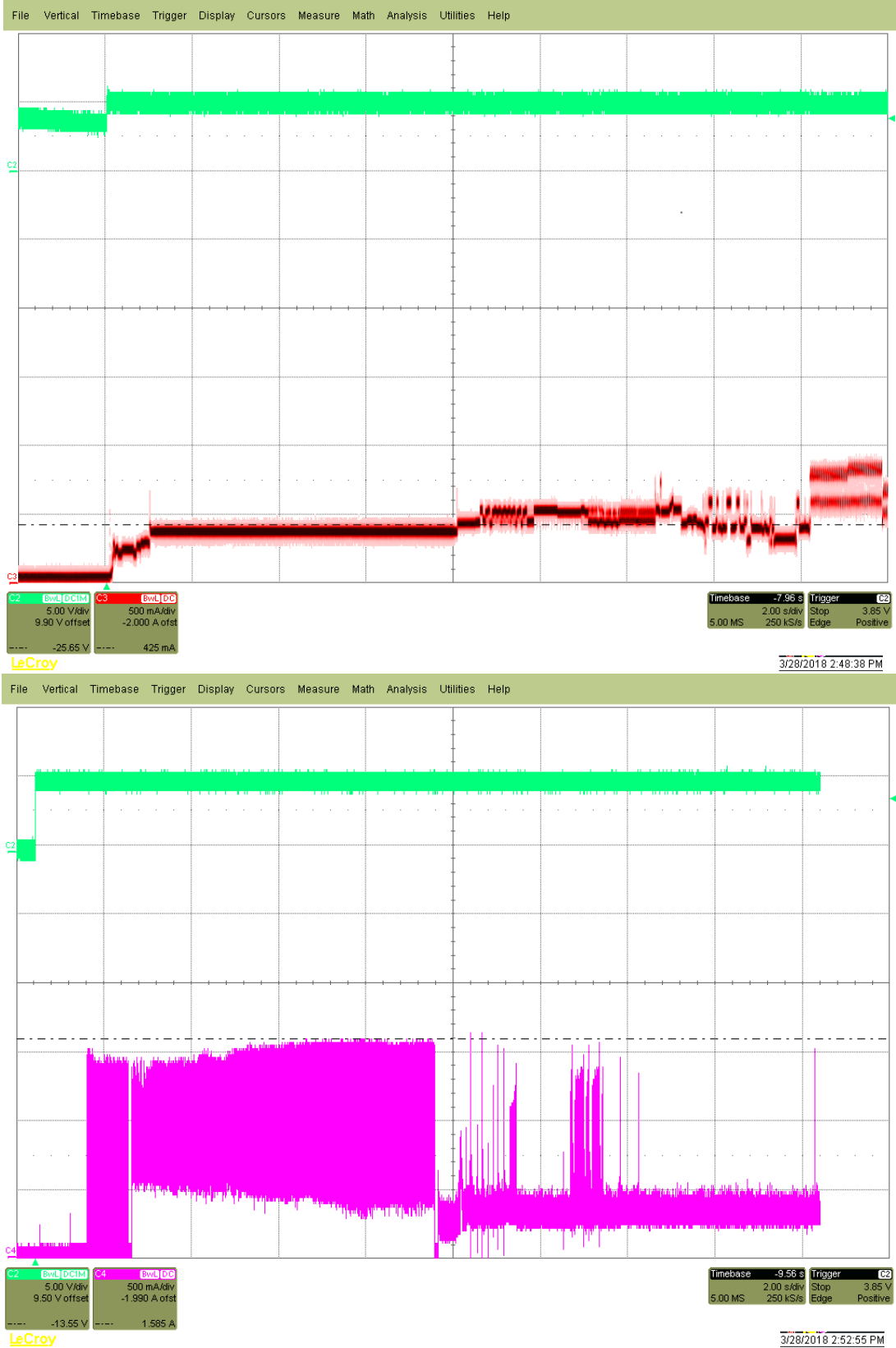
Figure 1. Typical 5V and 12V startup and operation current profiles