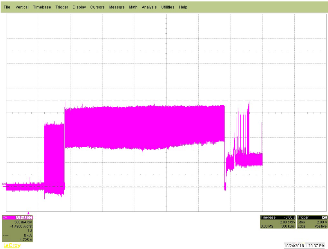
Figure 1. Typical 12V startup and operation current profile