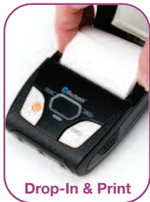
Drop-In & Print