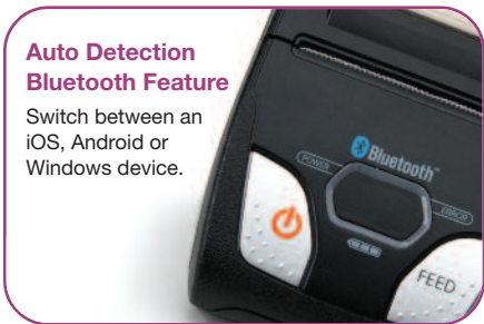
Auto Detection Bluetooth Feature

Switch between an iOS, Android or Windows device.