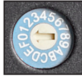
Rotary Dip Switch

The Rotary Dip Switch is located on the front of the Transmitter and Receiver .