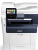
Xerox® VersaLink® B405 Multifunction Printer