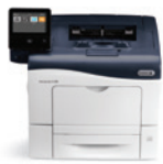
Xerox® VersaLink® C400 Color Printer