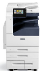
Xerox® VersaLink® C7020/ C7025/C7030 Color Multifunction Printer