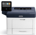
Xerox® VersaLink® B400 Printer