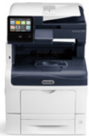
Xerox® VersaLink® C405 Color Multifunction Printer