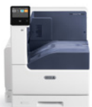
Xerox® VersaLink® C7000 Color Printer