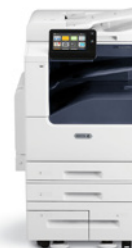
Xerox® VersaLink® B7025/B7030/B7035 Multifunction Printer